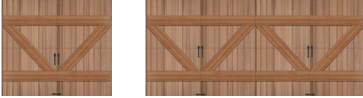
Design 8 available in one style configuration