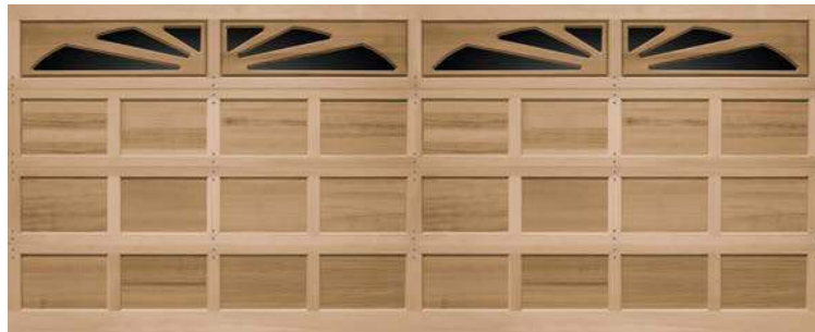
Horizon (16' Wide)