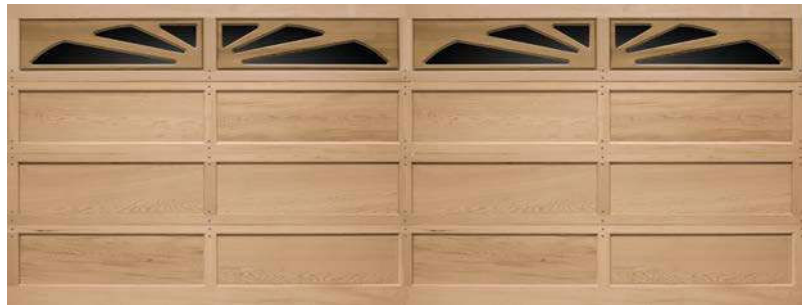
Horizon (16' Wide)