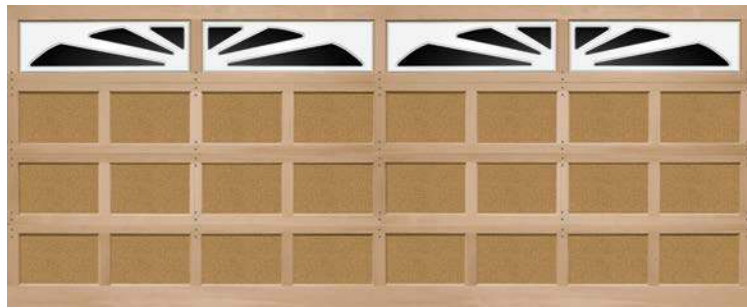
Sunset (16' Wide)