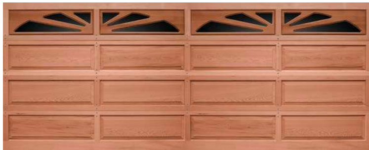
Horizon (16' Wide)