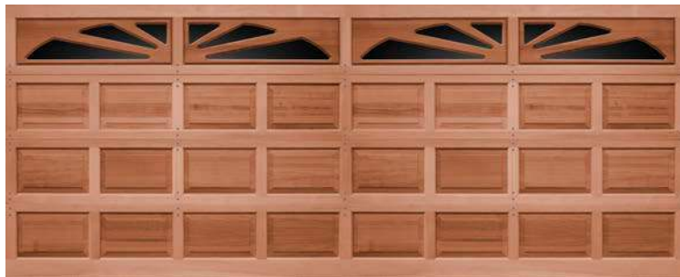
Horizon (16' Wide)