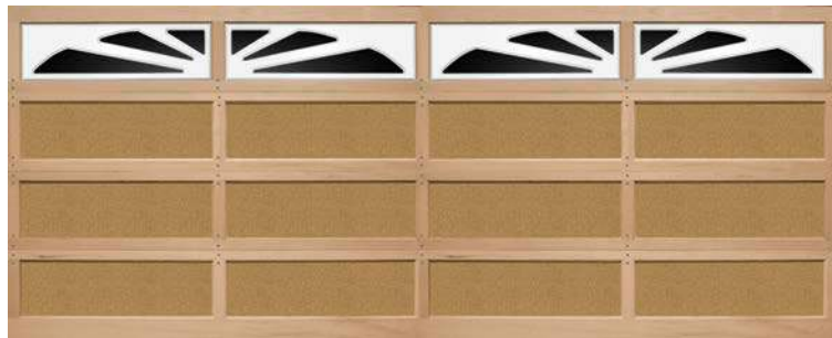
Sunset (16' Wide)